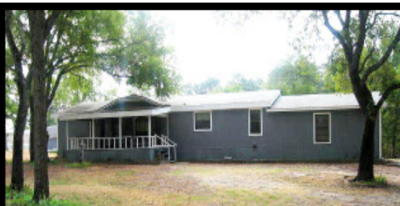
VAN ISD $69,900

Quaint little home. 3 bedroom, 1 bath, 1-car garage, vinyl siding, CH/A, landscaped, storage building, back porch with awning.