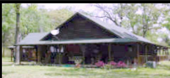
CANTON ISD $245,000

Waterfront in Cochise Village on cove. 3/2.5/2 tri-level home. 2 wood burning fireplaces, enclosed veranda on 2nd floor to view lake. Hunt County, Quinlan ISD.