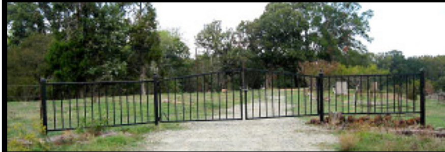
MARTINS MILL ISD $250,000

Ready for your horses, pond, equipment barn, tack room, stalls, pipe fencing, 4/3 brick on 30 acres, located on FM 1504. WBFP vented for heat, new granite tops & fixtures in 2 baths. Kitchen with cabinets galore. MLS#11703305