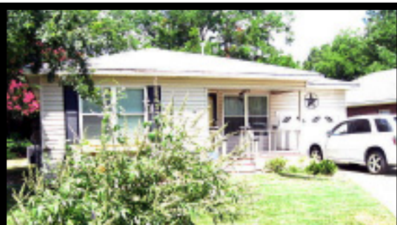
WILLS STREET $65,000

Davies Crest Ranchettes. 4 bedroom, 3 bath, 2 car carport, Palm Harbor DW on 3 acres. Large & roomy. Double fireplace between living & dining, split BR's. Partially chain link fenced. Fig, pear & plum fruit trees w/lg. oaks around property.