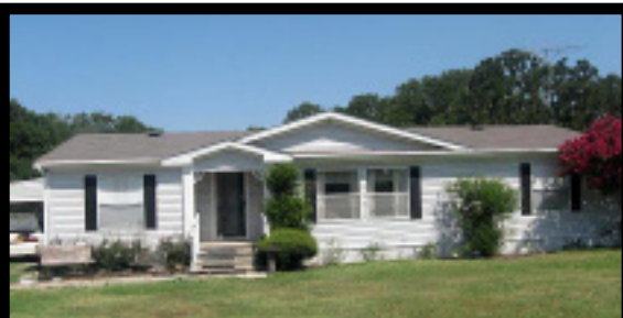
WILLS POINT ISD $119,900

3/2/2 brick on 3 acres. Hwy. 198, 2 living areas, mock fireplace, built-in hutch, ceramic tile and carpet floors, breakfast bar between kitchen and dining, circle drive, mature trees.