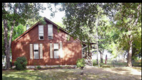
LAKE TAWAKONI $119,900

39.13 scenic acres w/3 building sites, well and electric at old home site, decorative entry gate, stock pond, 3 natural springs and Kickapoo Creek runs across one corner, mature trees. 2,660± ft. of road frontage. Located just off FM 2909 on CR 4112.