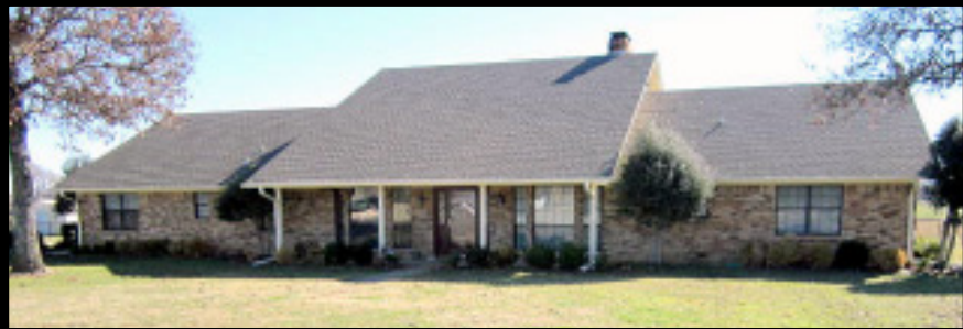
EDGEWOOD ISD $399,900

Ready for your horses, pond, equipment barn, tack room, stalls, pipe fencing, 4/3 brick on 30 acres, located on FM 1504. WBFP vented for heat, new granite tops & fixtures in 2 baths. Kitchen with cabinets galore. MLS#11703305