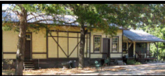
EAST OF CANTON $239,900

3/2 Patriot doublewide on 10 acres. Living, kitchen, dining open, split bedrooms, covered deck on the back to sit and look over wooded acreage behind home. Pond. Home sits back on property from road.