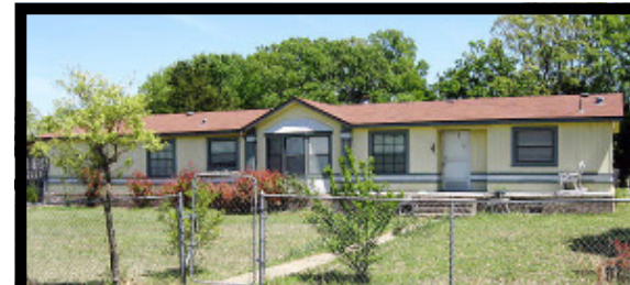
WILLS POINT ISD $79,000

Unique home in 1901 train depot. 2/2, WBFP, 2 living areas, still has train ticket window and some original flooring. Located deep in the woods of 40 acres, look out upon pond, outdoor kitchen in covered area for family reunions, gazebo, outdoor bathrooms and shower house for outside gatherings. Located close to I-20 & Hwy. 64. Van ISD