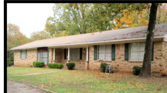
CANTON ISD $115,900

Satterwhite log home on 13.2 acres. 3/2/2CP ceramic & wood floors, an addition by Wilkerson & Tunnel, porches on 3 sides, master has sitting room or study entry, breakfast bar open to 2nd LA, WB stove plus FP, loft in living for storage or deco, metal workshop w/21x30 CP on back. Wood 2-story barn w/3 stalls.